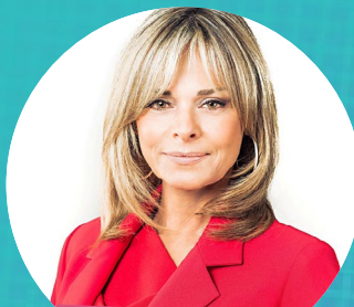
KEY NOTE SPEAKER SUSAN HAY GLOBAL NEWS