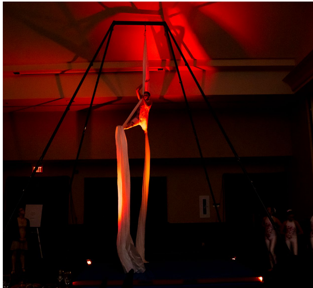
Athletes from Whitby Gymnastics & Circus School dazzled guests during the gala's reception and dinner.

"It is my pleasure to share that the Chamber Accreditation Council of Canada met last week and had approved the re-accreditation of the Whitby Chamber of Commerce," announced Eaton. "Chamber accreditation is a formal acknowledgment that a Chamber or Board of Trade has been successfully evaluated against rigorous criteria for policy, service and performance."