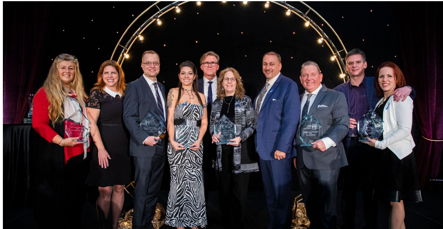
Winners of the 2019 Business Achievement Awards show off their hardware at the Peter Perry & Business Achievement Awards.

and deserving businesses and we're all building something amazing."